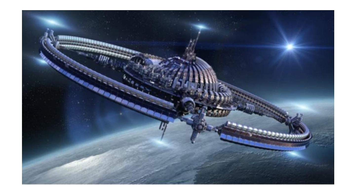
HELP STOP THIS!

Plan B is as fictious as the lie that sustainable healthcare harms patients!